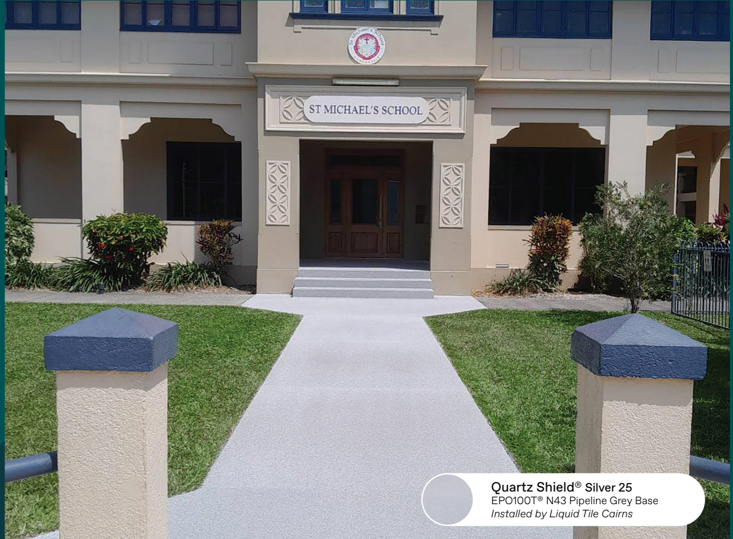
Quartz Shield® Silver 25 EPO100T® N43 Pipeline Grey Base Installed by Liquid Tile Cairns