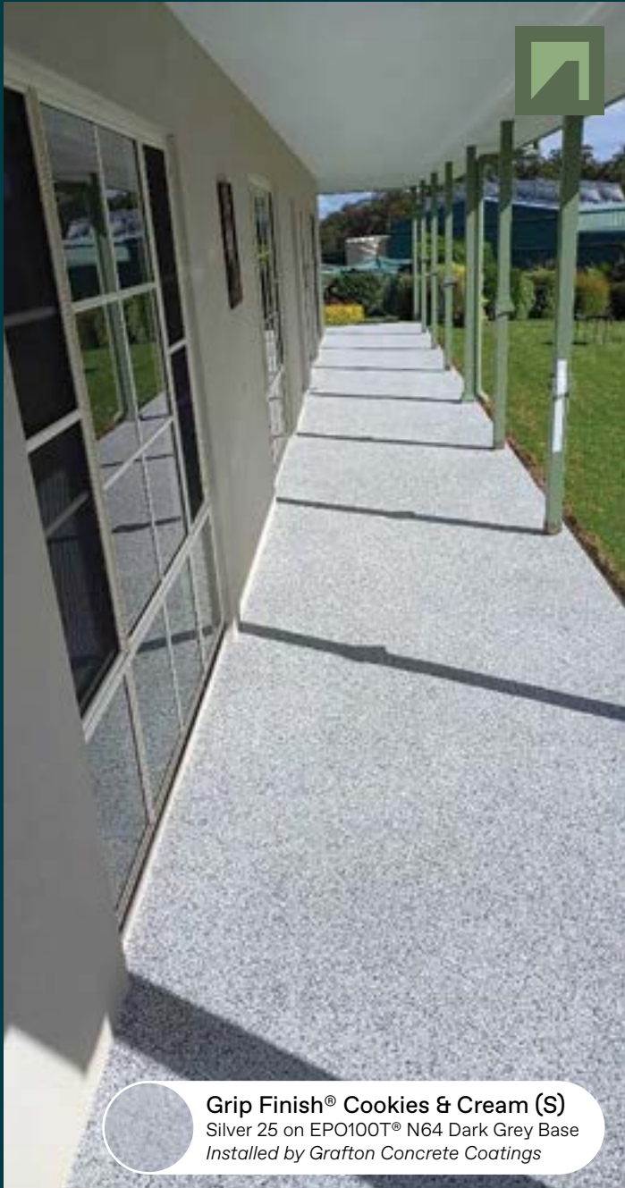
Grip Finish® Cookies & Cream (S) Silver 25 on EPO100T® N64 Dark Grey Base Installed by Grafton Concrete Coatings

Hard wearing, mould resistant and hygienic, this finish is the perfect way to stand out from the neighbours and know you have a flooring system you can count on for years to come.