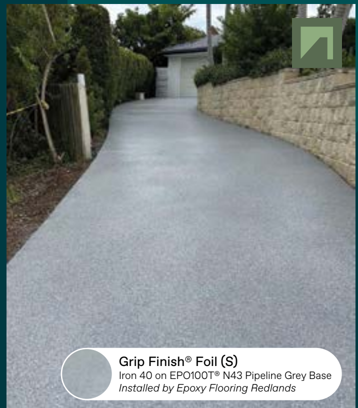
Grip Finish® Foil (S) Iron 40 on EPO100T® N43 Pipeline Grey Base Installed by Epoxy Flooring Redlands