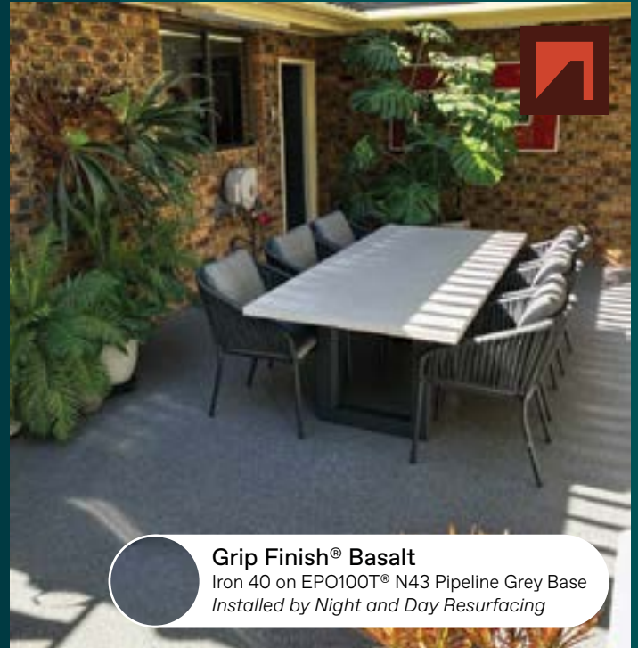
Grip Finish® Basalt Iron 40 on EPO100T® N43 Pipeline Grey Base Installed by Night and Day Resurfacing