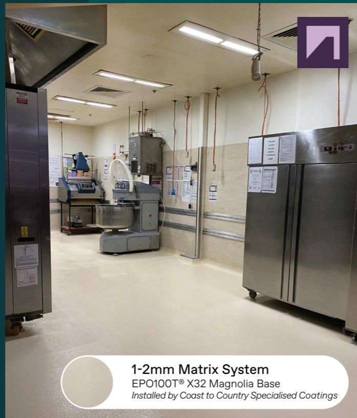
1-2mm Matrix System EPO100T® X32 Magnolia Base Installed by Coast to Country Specialised Coatings