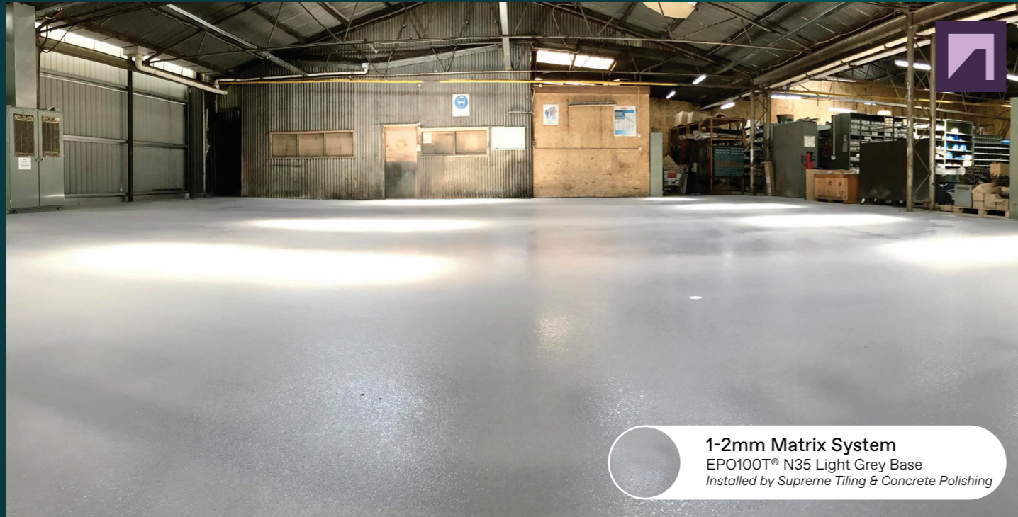
1-2mm Matrix System EPO100T® N35 Light Grey Base Installed by Supreme Tiling & Concrete Polishing

EPO100T® is used in a wide range of commercial & industrial environments where a long lasting floor or wall solution is required. Trusted by asset owners for 20 years as a long term Australian made Epoxy.