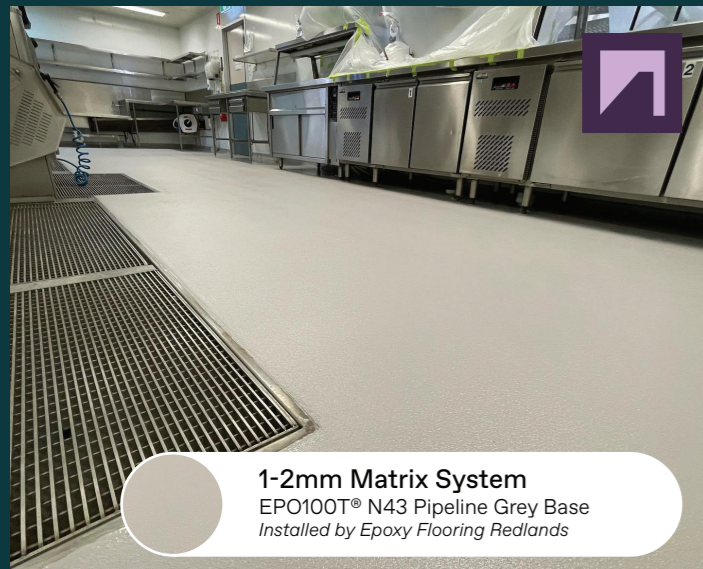
1-2mm Matrix System EPO100T® N43 Pipeline Grey Base Installed by Epoxy Flooring Redlands