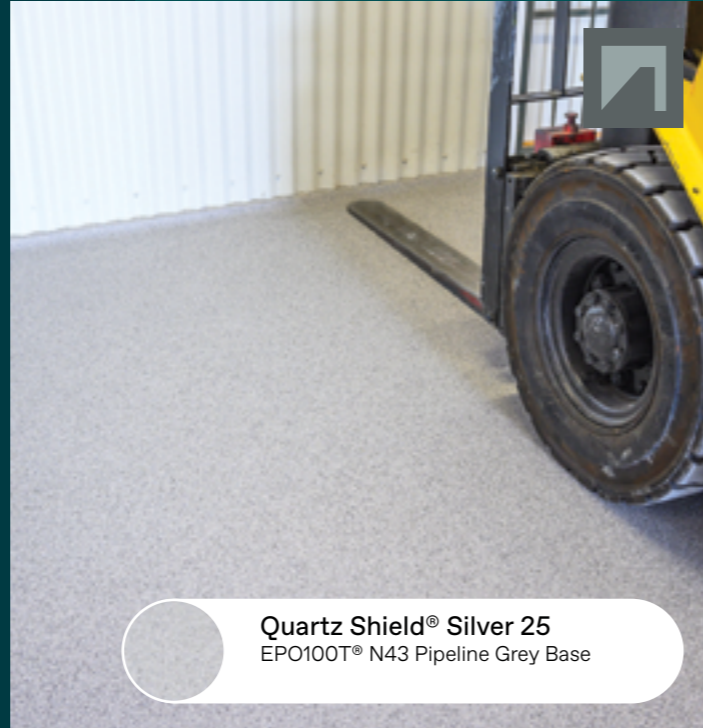
Quartz Shield® Silver 25 EPO100T® N43 Pipeline Grey Base