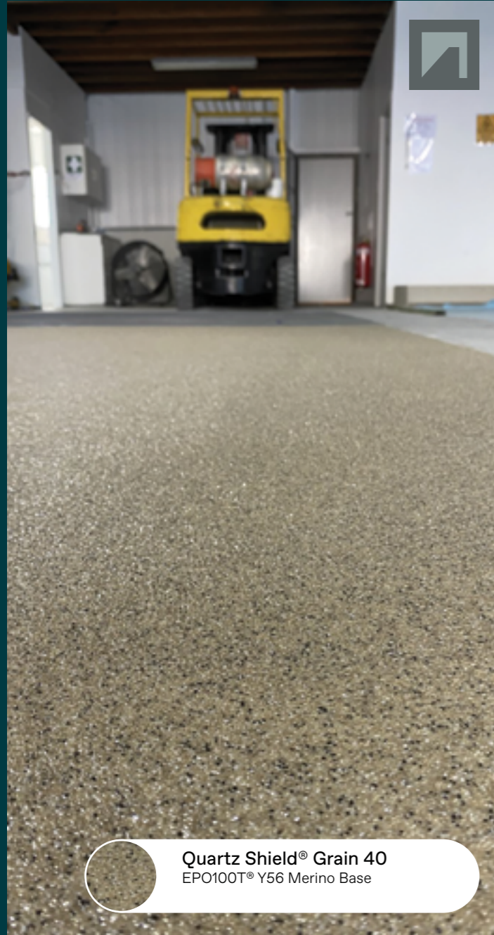
Quartz Shield® Grain 40 EPO100T® Y56 Merino Base

The applications and benefits are perfectly complemented by a dynamic colour range including, Arctic, Grain, Iron, Silver and Wine. These colours further increase the appeal of this system and confirm Quartz Shield® as a choice for businesses and asset owners.