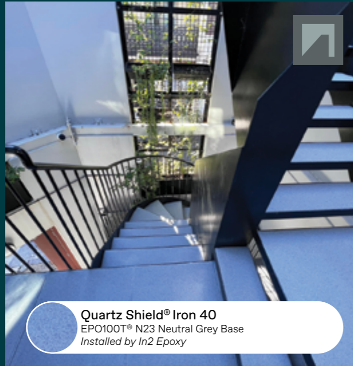
Quartz Shield® Iron 40 EPO100T® N23 Neutral Grey Base Installed by In2 Epoxy