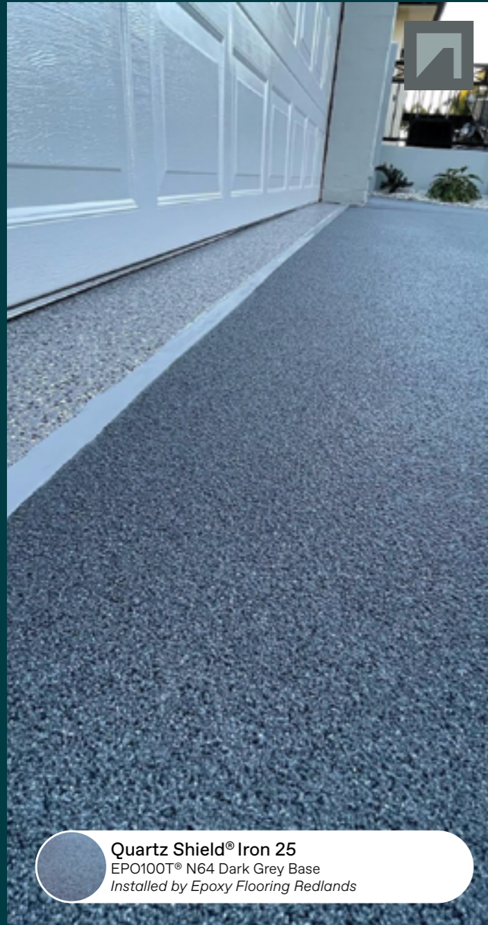
Quartz Shield® Iron 25 EPO100T® N64 Dark Grey Base Installed by Epoxy Flooring Redlands

The applications and benefits are perfectly complemented by a dynamic colour range including, Arctic, Grain, Iron, Silver and Wine. These colours further increase the appeal of this system and confirm Quartz Shield® as a choice for businesses and homeowners.